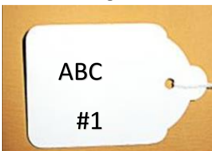
Front of Tag